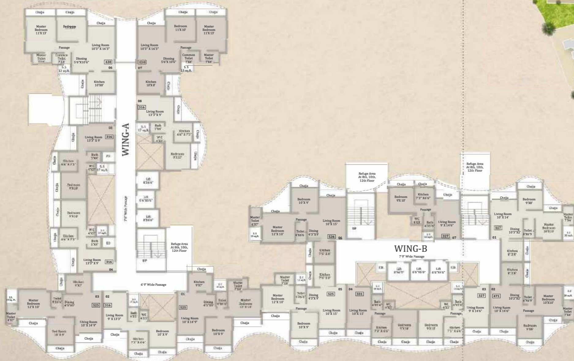
G+14 RESIDENTIAL FLOORS

NOTE : All common amenities will be provided after Housing Federation Approval